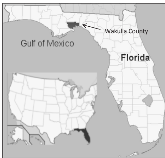
Figure 1. Site Location—Wakulla County, Florida

Wakulla Springs is located in Wakulla County (figure 1), just south of Tallahassee, Florida in the Woodville Karst Plain (WKP). The 6,000 acre site has many recreational amenities, including boat tours, hiking, horse trails, swimming, a lodge and restaurant, and recreational diving opportunities.